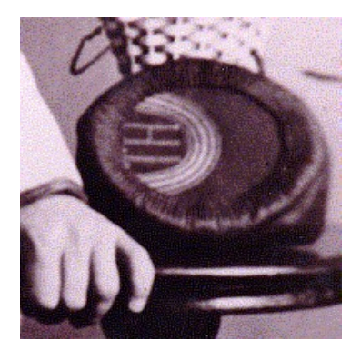
An enlargement of the picture showing the King's initials.

reminders of Montenegrin sovereignty were suppressed. Even the traditional Montenegrin hat which displayed the Cyrillic initials of King Nikola was banned and a new Serbian symbol was required to be worn atop formal hats.