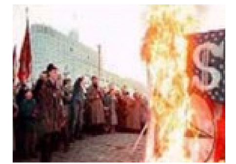
Anti-NATO demonstration in front of the Russian Parliament. April 1999

However, in spite of an ample anti-NATO campaign, Russian public opinion never favored at large military support for the rump Yugoslavia. If in October 1998, when 44% of Russian respondents in an opinion poll favored the action against 53%, then in April 1999, at the height of NATO strikes, only 36% were in favor, with 61% being against. And even if a larger percentage declared its readiness to go to fight as volunteers in Yugoslavia –67% against 27%–, there has been no confirmation of organized Russian military groups fighting on the Serbian side.<sup>39</sup> Nor could any Russian volunteer face a NATO pilot flying at 30,000 feet.